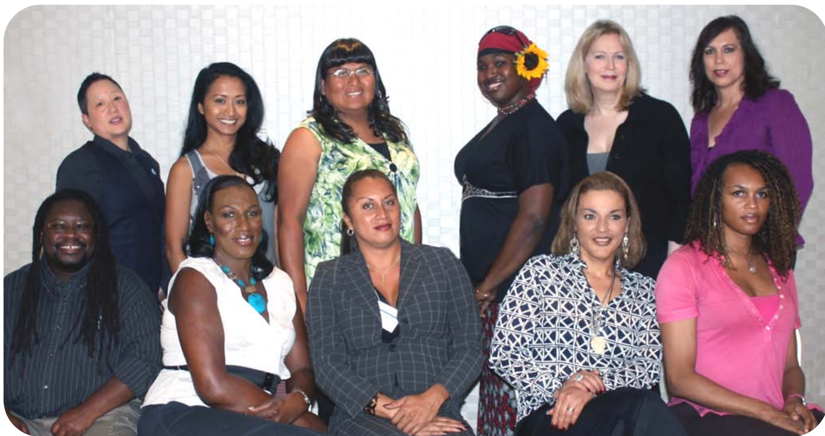
CoE National Advisory Board

Since 2007, the Center of Excellence for Transgender Health (CoE) has utilized a coalition-building approach to mobilize transgender (trans) communities throughout the United States. The CoE, along with its National Advisory Board, has identified and supported community leaders, health departments, and key stakeholders in engaging the trans community, identifying gaps in service provision, and developing strategies for addressing identified but unmet needs in the U.S. The CoE supports local community efforts in organizing conferences, symposiums, and summits that are focused on trans-specific health and well being.