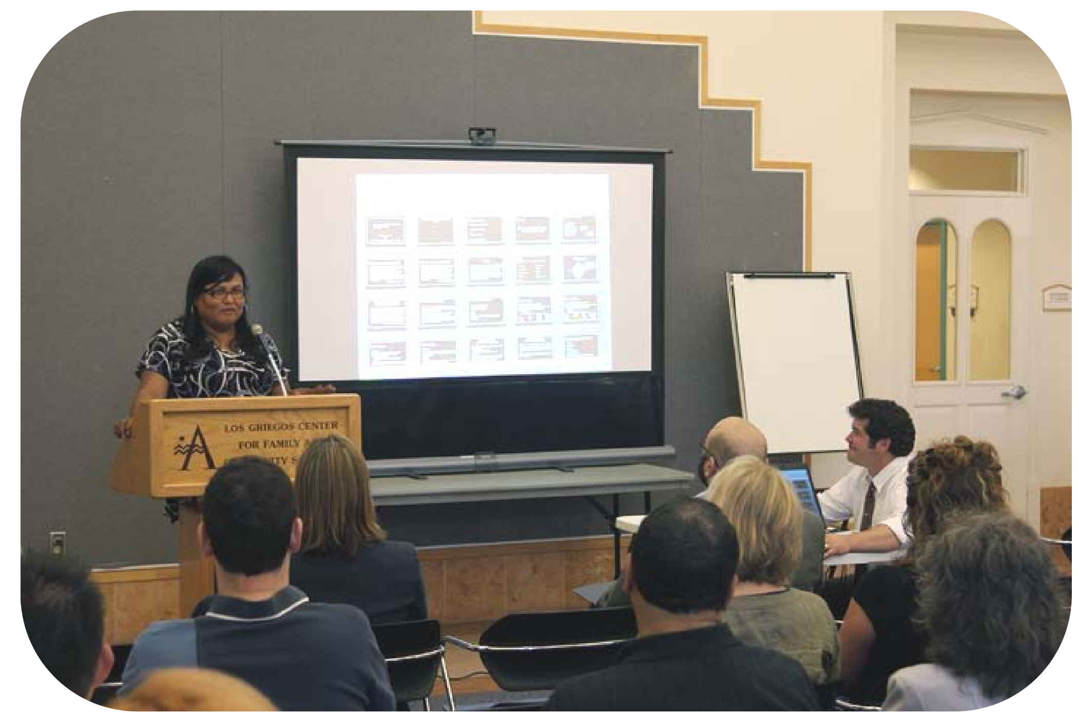
New Mexico Transgender Coalition