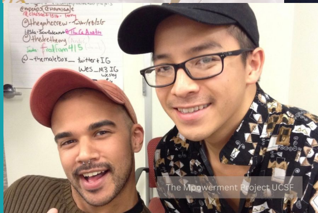
The Mpowerment Project UCSF