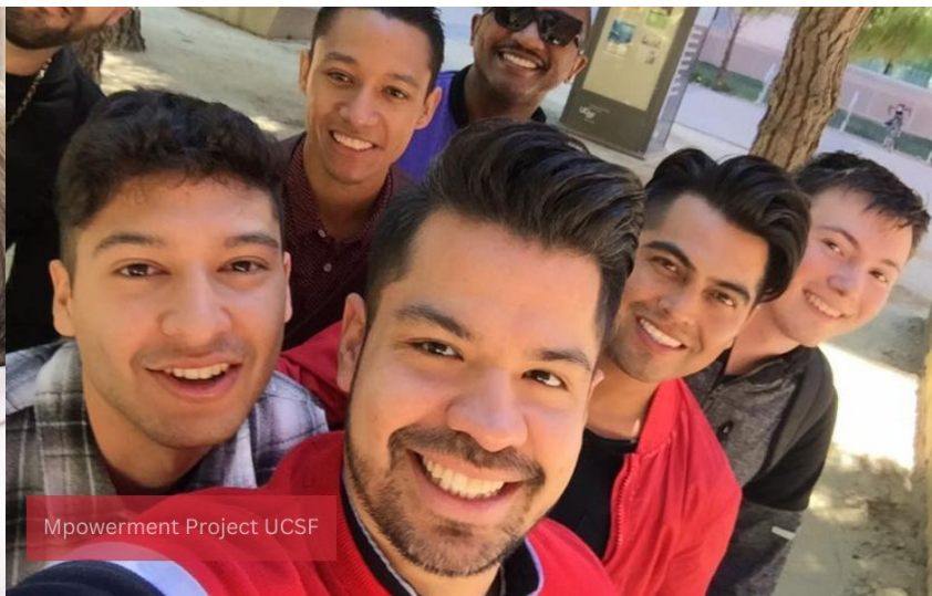
Mpowerment Project UCSF